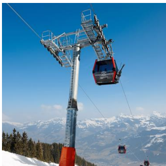
GD10 Wagstättbahn, Kitzbühel/AT