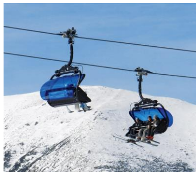
CD6C Lucky Priečno, Jasna, SK