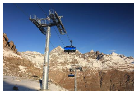
CD6C Joscht-Hirli, Zermatt/CH

The LEITNER DirectDrive works using a synchronous motor that is directly linked to the sheave. It consists of three moving parts – the rotor and two bearings. In contrast to conventional planetary gear drive systems, absolutely no engine oil is required. Since the LEITNER DirectDrive comprises fewer parts and has a lower rotational speed, wear and the risk of breakdown are significantly reduced. In addition to better reliability, another impressive feature of the LEITNER DirectDrive is